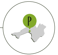
PROSECCO DOCG ZONE